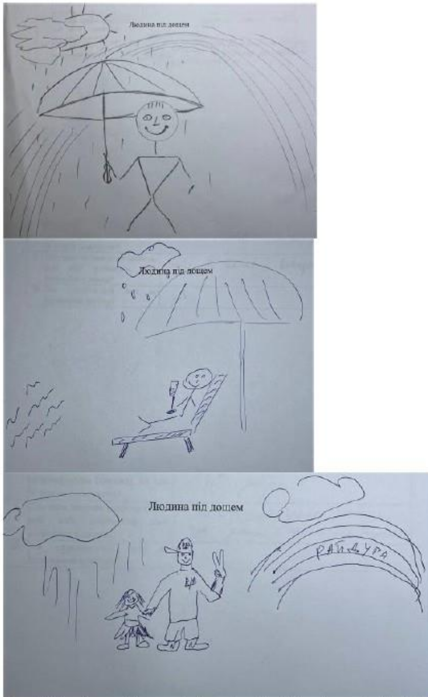
Fig. 2. Drawings of respondents using the "The Person-in-the-Rain Drawing" method (high level)