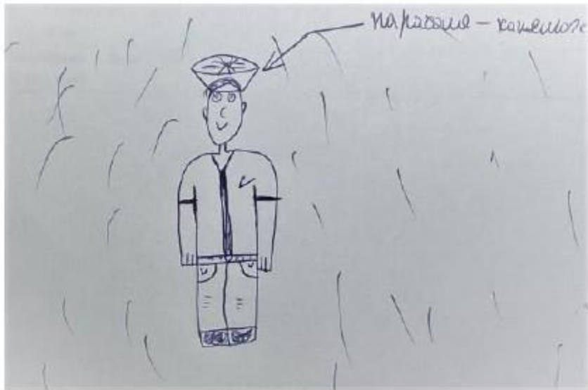
Fig. 3. Drawings of respondents using the "The Person-in-the-Rain Drawing" method (medium level)

Individuals with a low level of resistance (45%) in drawings of a person in the rain usually show sideways, unstable male and female figures at the bottom of the picture, which are significantly smaller compared to the image of a person (Fig. 4). This peculiarity indicates the presence of a depressive mood, a tendency to plunge into the world of fantasies about the past or future, a desire to escape from problems. The instability of the person in the picture can mean tension, lack of a core, balance.