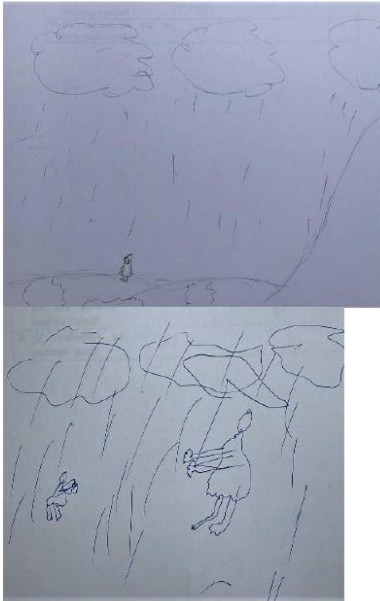
Fig. 4. Drawings of respondents using the "The Person-in-the-Rain Drawing" method (low level) (Source: authors' own contribution)